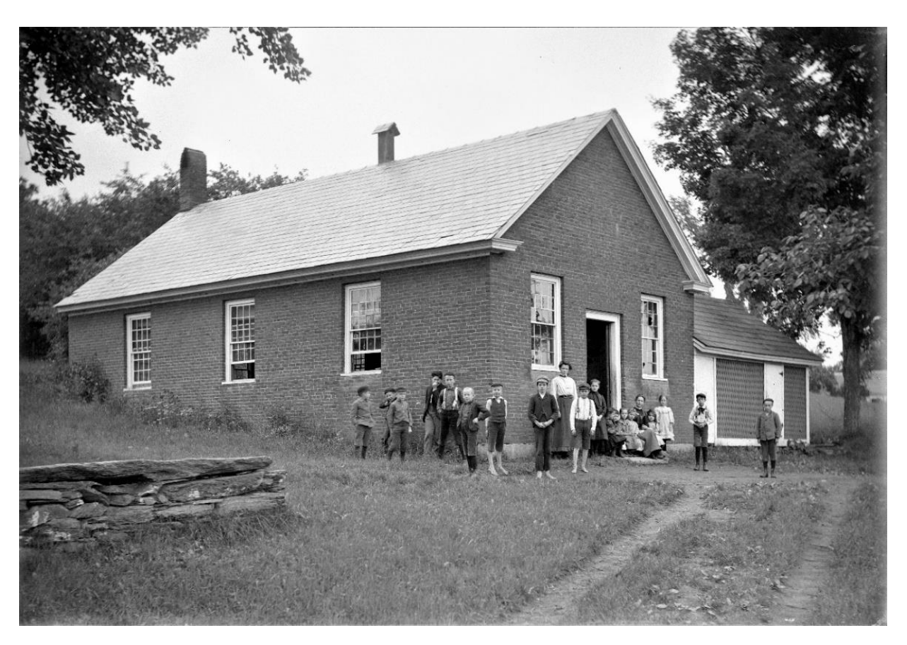
Putney's No. 2 School House was just south of the Crawford House (part of which is visible on the right). The school (called Schoolhouse No. 12 in the early 1800s) was taken down in the first years of the 1900s when scattered neighborhood schools were consolidated in the larger "Central School" built at the top of Kimball Hill (close to the village). Evidently common schools did not require footwear in the 1800s.