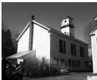
Above: Maintenance issues include the rotten shed out back.

The old church building at 15 Kimball Hill is busy, while ailing in some respects. The frame is strong, but unless we make roof repairs (10K), improve insulation (6K), ventilate the crawl space (5K), and paint the build-