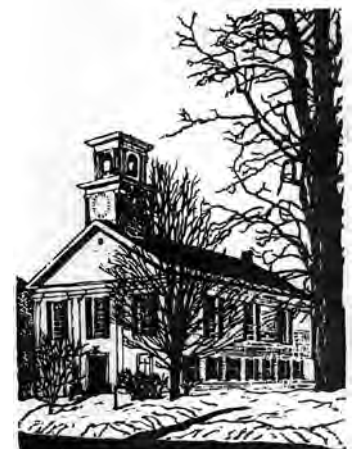
Margot Torrey's beautiful woodcut

We've invested 12K. All of us use this space. The building is at risk. Can you help us keep it vital?